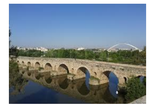
And this is the Merida bridge with the Guadiana river.

This monument is built in 16 and 15 b.C.The theater has undergone several renovations,the most important.in the late 1st or early 2nd century.